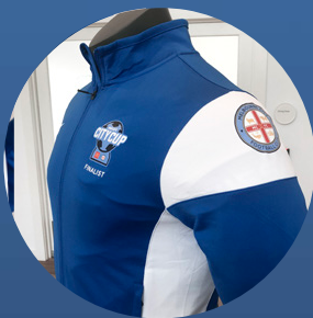
OFFICIAL MACCA'S NIKE CITY CUP WALK OUT JACKET