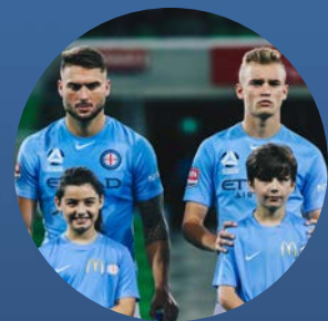
THE CHANCE TO PLAY IN THE MACCA'S CITY CUP FINALS AT CITY FOOTBALL ACADEMY

WIN THE 2018 MACCA'S CITY CUP CHAMPIONS TITLE AND YOUR TEAM WILL SCORE: