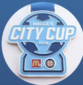
2018 MACCA'S CITY CUP FINALIST MEDAL